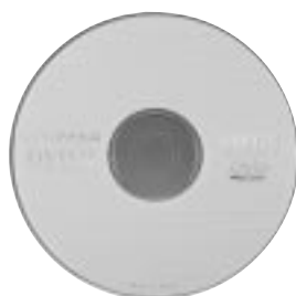
3.95GB DVD-R DISC DVS-V3950S-A