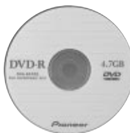
4.7GB DVD-R DISC* DVS-R4700-T19 (Ver.1.9)

*4.7GB DVD-R : DVD-R Disc with Ver.1.9 "SAMPLE MEDIA" will be provided until ver.2.0 becomes available.